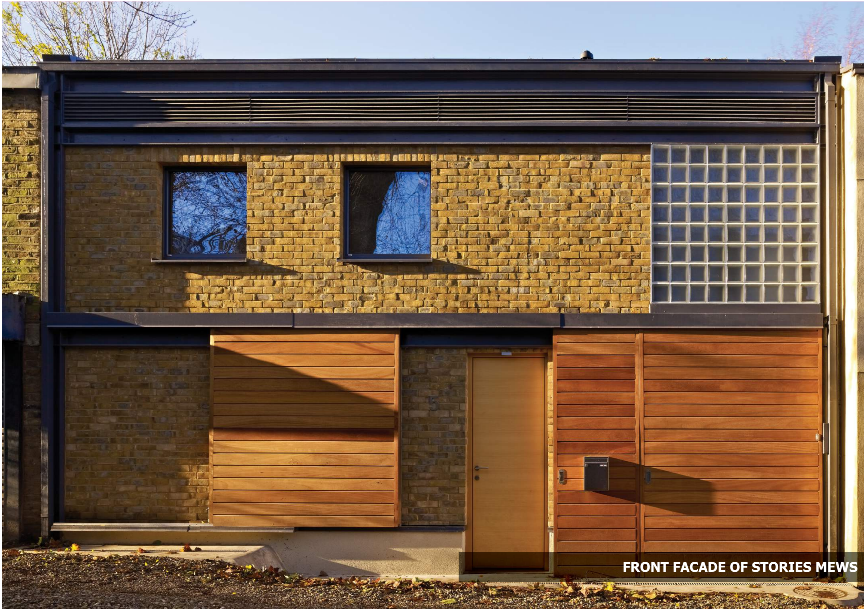
FRONT FACADE OF STORIES MEWS

Stories Mews is a contemporary terraced house in South London with an artist's studio that can be completely annexed from the living areas, allowing for functional flexibility for the artist and his family over the lifetime of the house. Passivhaus certification was achieved despite the house being on a challenging tight urban site in a conservation area with stringent aesthetic planning conditions. To meet the Passivhaus thermal envelope and airtightness requirements, RDA developed bespoke details for the timber SIPs structure of the house, namely for the foundation, external garage door, green roofs, skylight, MVHR external grilles and external facade. The result is a façade clad with London stock brick with sliding wooden shutters hung from an exposed steel beam that spans the frontage, and glass blocks for smaller areas of interest, that blends within the mews aesthetic of its surrounding context.