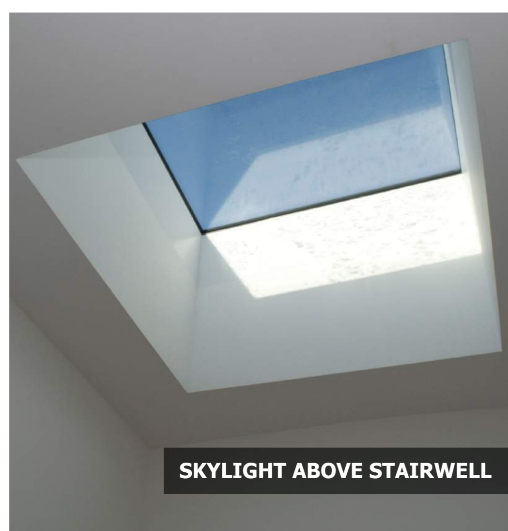
SKYLIGHT ABOVE STAIRWELL