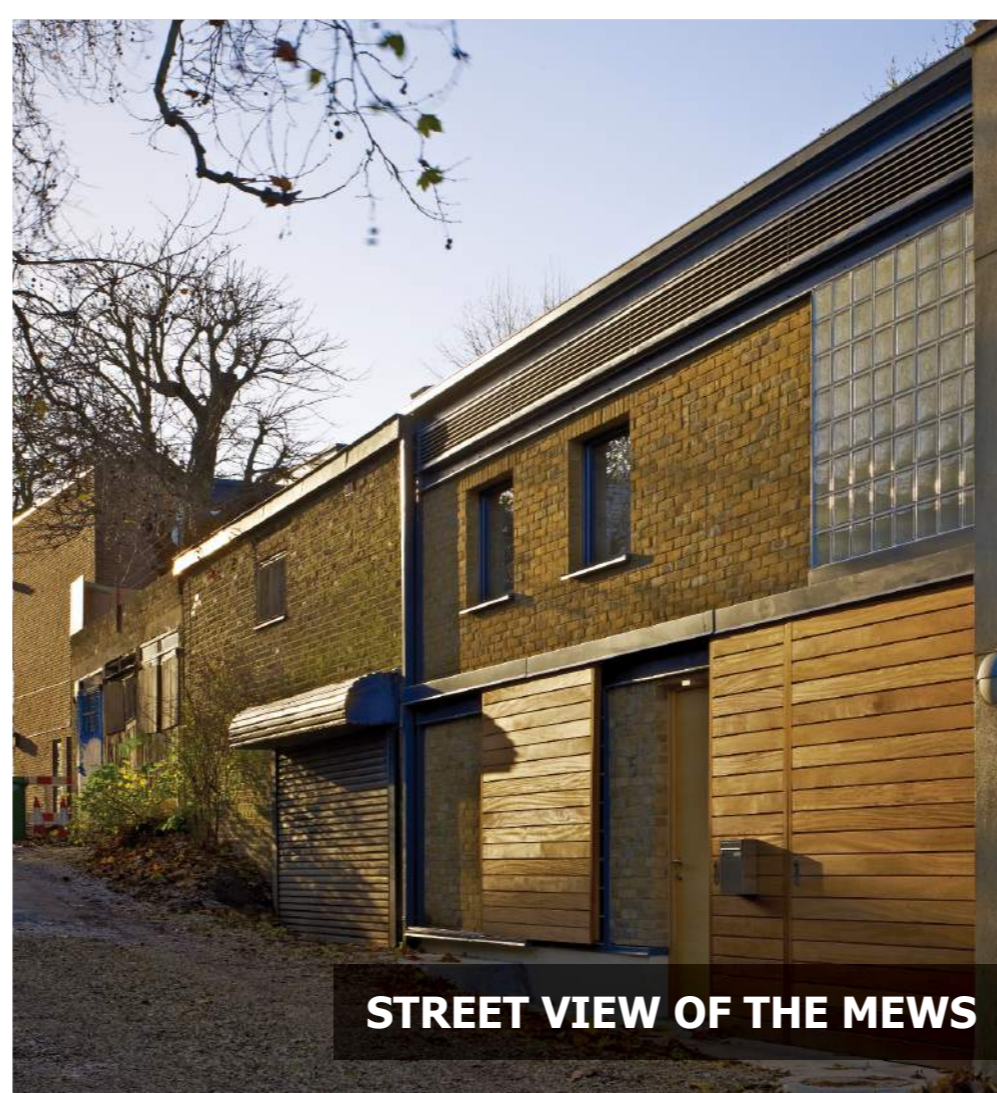
STREET VIEW OF THE MEWS